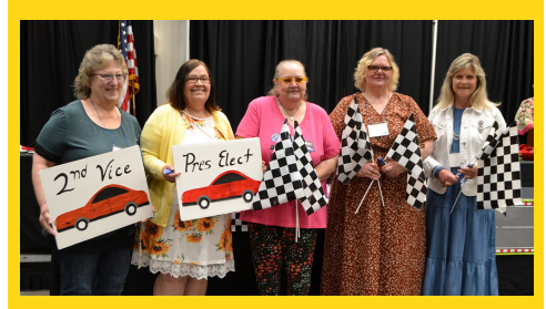
KEHA Incoming Officers were installed on May 9, after being elected on May 8.